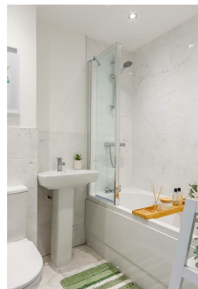
Ffordd Darwin, Barry, CF63 4RS